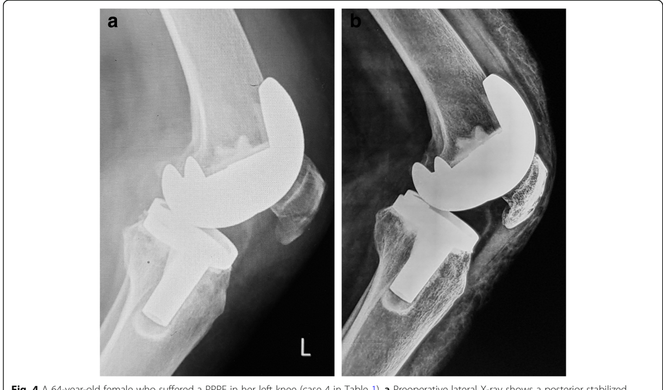
Fig. 4 A 64-year-old female who suffered a PPPF in her left knee (case 4 in Table 1). a Preoperative lateral X-ray shows a posterior stabilized system (Depuy) and minimally displaced fracture. b The fracture is managed conservatively with good union one year later